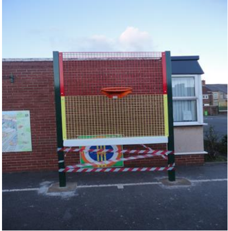
Equipment being broken (injury to both adults and children)