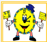
EYFS/ KS1 Australia